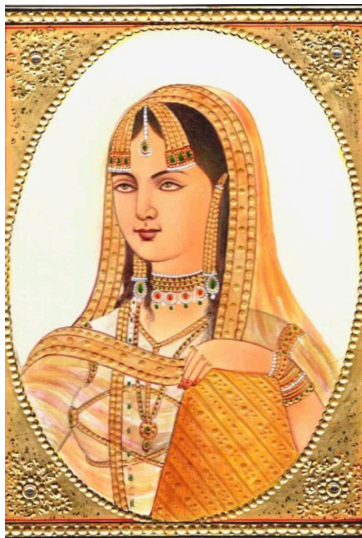
Mariam-Uz-Zamani, Wife of Akbar the Great (Jodha Bai Real Pic)