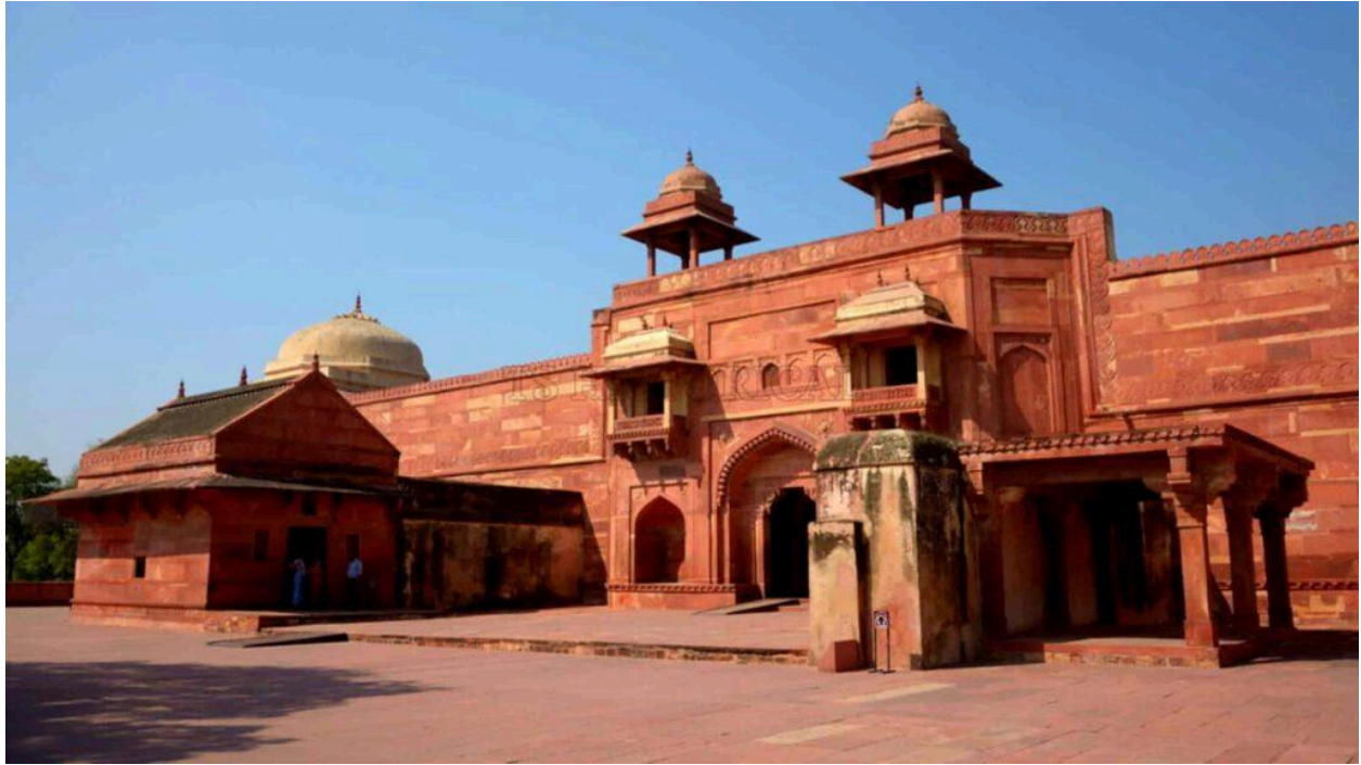
Jodha Bai Mahal, Fatehpur Sikri, Uttar Pradesh

Jodha Bai Palace also known as Jodh Bai Mahal is a very beautiful and luxurious palace located in Fatehpur Sikri Agra which was built by Akbar the Great for his most beloved wife Jodha Bai/Mariam-Uz-Zamani . This palace is the largest complex of Zenana .