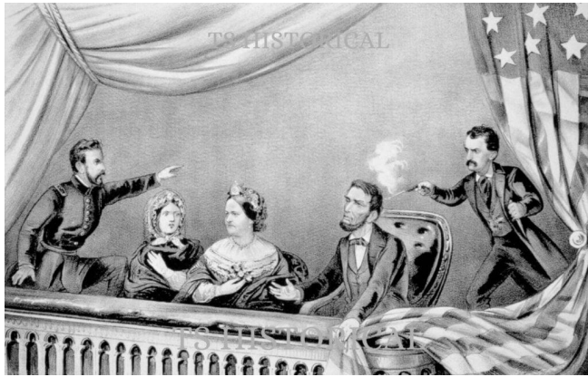
Abraham Lincoln Death

On April 14, 1865, President Abraham Lincoln and his wife were visiting a play at the Code Theater in Washington DC, where John Bilkis, a famous actor, was shot and died the next day, April 15, 1865. Friends, we get this lesson from the struggles after which Abraham Lincoln achieved such great success, if we want to achieve anything in life, then we have to move forward with never-give-up thinking.