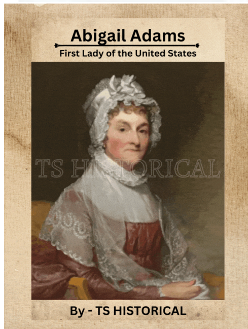
Abigail Adams (First Lady of the United States)