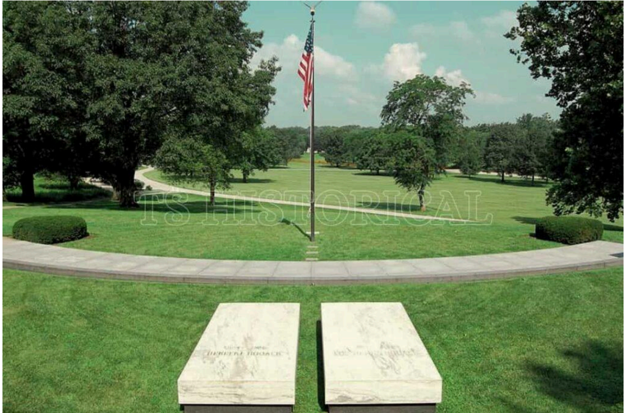
Herbert Hoover Tomb, Presidential Library and Museum, West Branch, IA

The tomb, a dignified and understated structure, stands as a poignant reminder of Hoover's enduring belief in the potential for individuals to impact society positively.