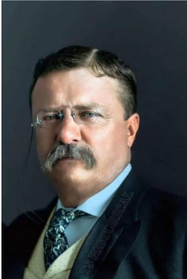
Theodore Roosevelt, 26th President of the United States